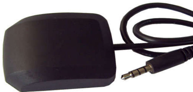
Figure 1: SKM51D Top View